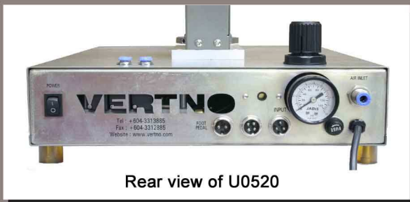
Rear view of U0520