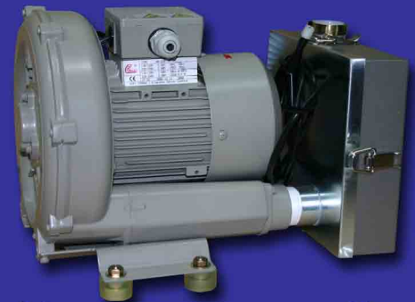
Vacuum pump + filter