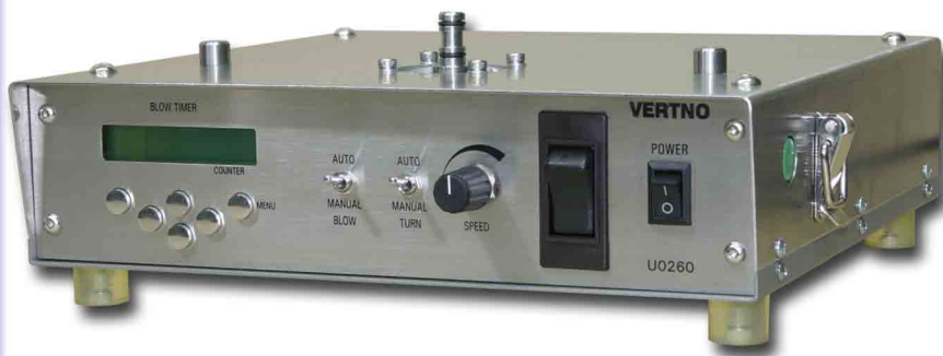
Front view of U0260