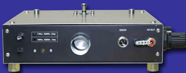
Rear view of U0260