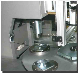
Hydraulic press with adjustable stroke.