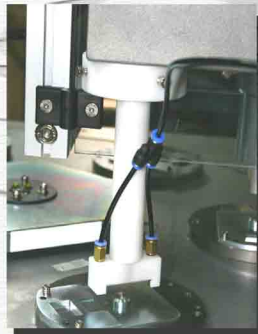
Air blow + vacuum cleaning system.